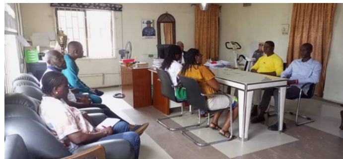
Advocacy visit to NPF Ugelli Area Commander