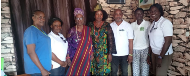
Visit to the Iyalode and Yeye Oge of Igbokoda in Ilaje LGA