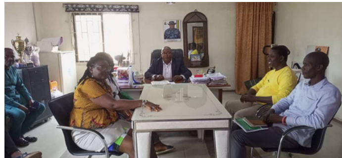
Advocacy visit to NPF Ugelli Area Commander

This advocacy visit marks another crucial step in P4P's mission to build stronger, safer communities through partnerships with key stakeholders, ensuring that peace and security remain at the forefront of local development efforts.