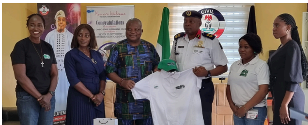
Advocacy visit to the commandant, Ondo State NSCDC

The consistent support from all the stakeholders visited reinforces the importance of this campaign and the collective resolve to safeguard peace during this critical period. With these endorsements, P4P Ondo State Chapter is better positioned to make a significant impact on electoral integrity and violence prevention as the elections approach.