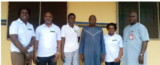
Advocacy Visit to the DCO of NPF Igbokoda