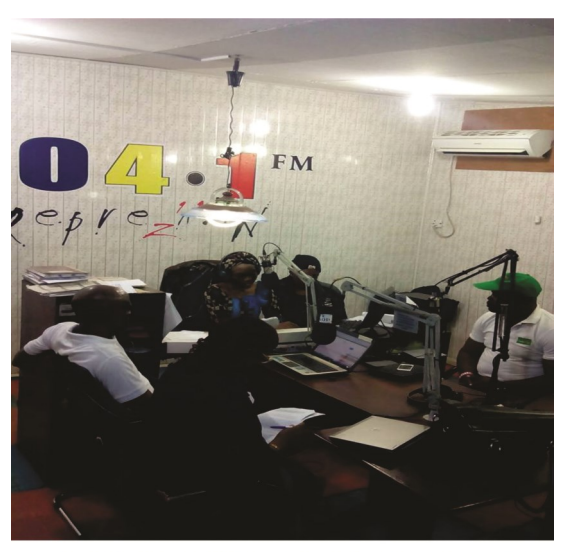
Abia Radio/TV intervention Programme at BCA and 104.1 FM