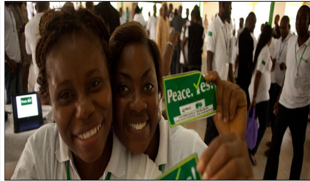
P4P Membership growth is on the rise continuously as at June, 2016 the Network had reached a total of 4,431 members.

However, as at 30th September, 2016 the membership increased with additional 150 members making an aggregate of 4,581 members of which 38% are females and 62% are males, with a total of 659 organizational members.