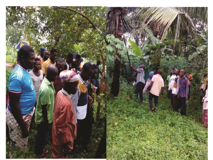
Practical Demonstration of Oil Palm Mechanical Harvester in Avonkwu Community

Abia State P4P; in September conducted a practical demonstration on the the use of the Oil Palm Mechanical Harvester to community leaders and farmers in Avonkwu Community in Isieke, Umuahia North LGA. The community leaders welcomed the idea and opted to get the machine for their people.