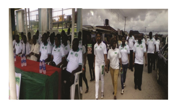
Delta P4P International World Peace Day Event