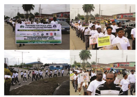
World Peace Day Event in Cross River State

Cross River State P4P; marked the International World Peace Day in collaboration with office of the State Security Adviser and other NGO's in the State with a 5km walk from Mary Slessor roundabout and ended at Leopard Town roundabout. At the end of the peace walk participants signed a communique which was sent to the State government for consideration. The communique urged the State Government to effectively monitor and use early warning signs of violent conflicts to mitigate and curtail conflict reoccurrence in the state, build strong institutions that will aim to curb inequality and also deploy transparency, inclusiveness, accountability, policy coherence, and implementation of previous peace and reconciliatory recommendations to tackle emerging conflicts".