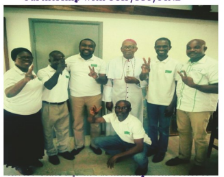
St. Joseph Catholic Parish in Assa, Awarra Court Area.